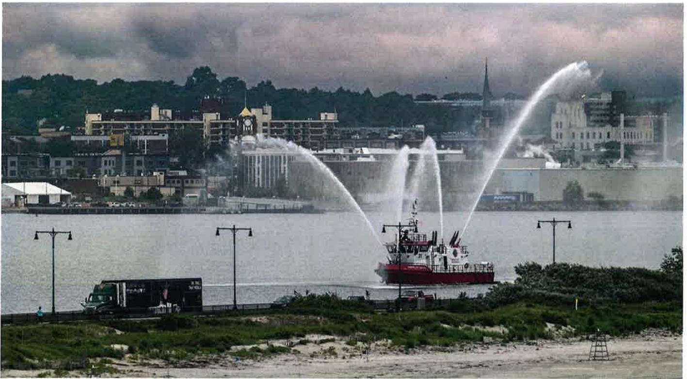
in Nahant, MA

Vietnam Veterans Memorial Replica Wall and Mobile Education Center spreads healing legacy of The Wall and educates about the impact of the Vietnam War