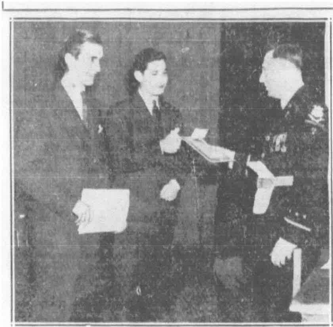
March 30, 1940 pg. 10