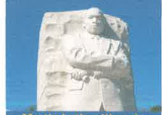
Martin Luther King, Jr. National Memorial